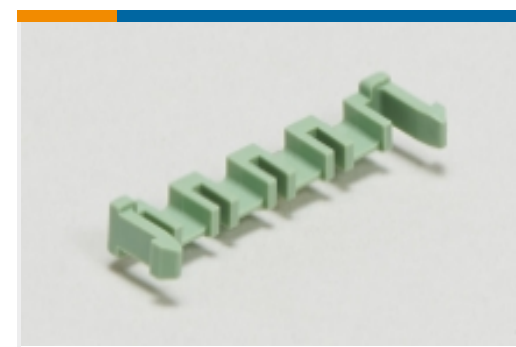
PCB Latches, Locks &amp; Retainers(2)